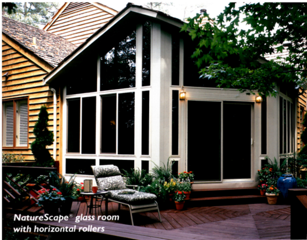
NatureScape® glass room with horizontal rollers