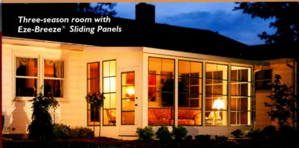
Three-season room with Eze-Breeze ® Sliding Panels

Eze-Breeze ® is a registered trademark of PGT Industries.