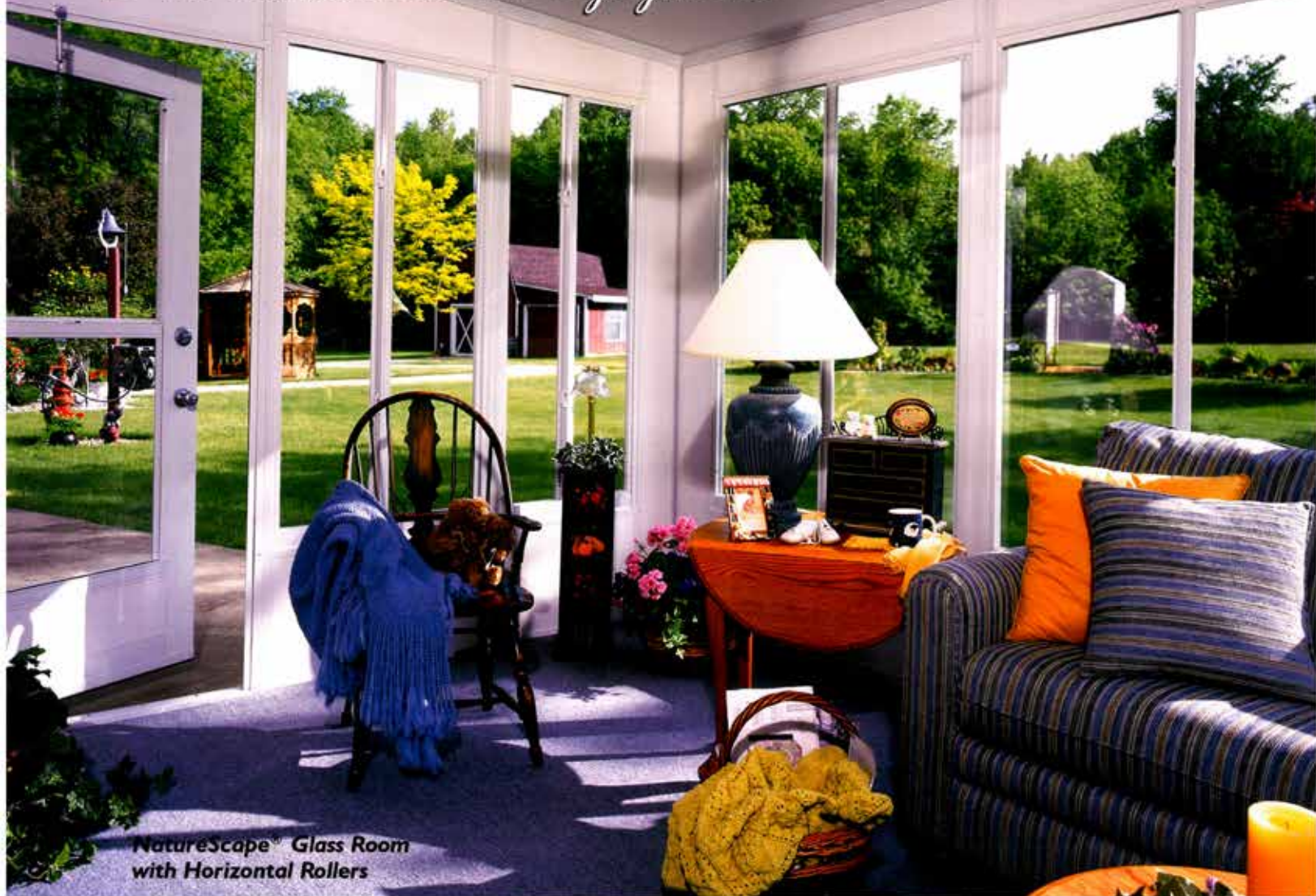
NatureScape® Glass Room with Horizontal Rollers