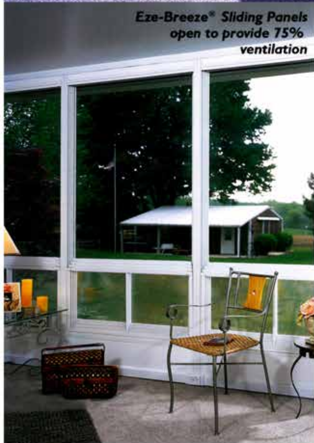
Eze-Breeze® Sliding Panels open to provide 75% ventilation